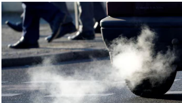
Fig. 1 Image highlighting the fuel emission from a vehicle.

Figure-2 Structures of polycyclic aromatic hydrocarbons (PAHs) considered as toxic pollutants as per environmental protection agency (EPA) and world health organization (WHO) present in fuel emission.