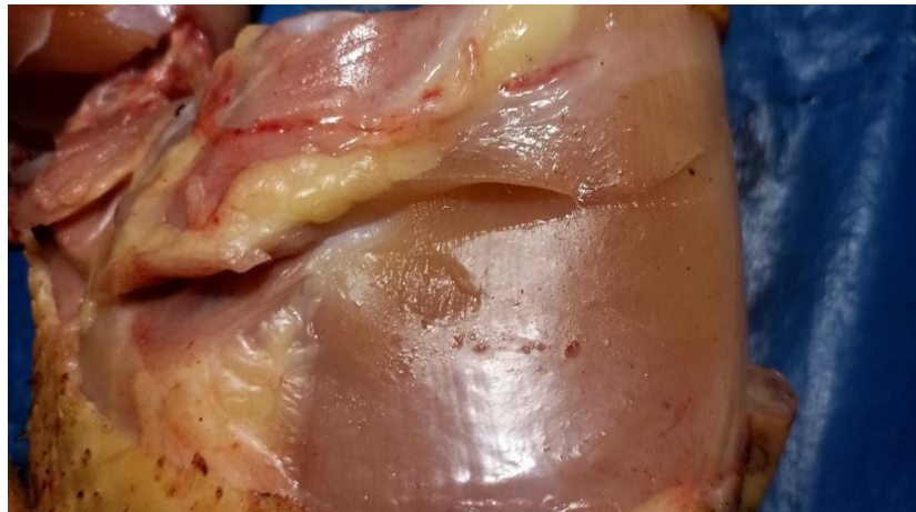
Fig. 3 The photographic images were taken by using a digital camera. A) Control sample imaged from freshly slaughtered meat sample without exposure of emission fuel, B) Sample from a butcher shop exposed to emission fuel of transport vehicles across the road.

B) Sample from a butcher shop across the road with meat products exposed to fuel exhaust